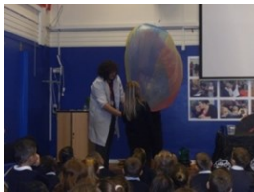
Here we were making an air balloon fly using a hair dryer!