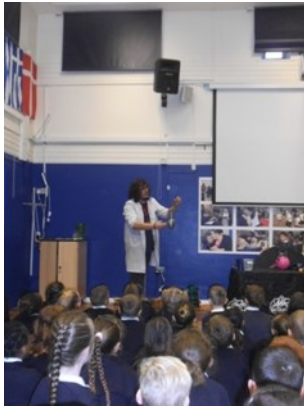
Here is where we were trying to make a ping pong ball fly!